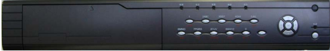
Front Panel of LEISURELITE

LEISURELITE series network digital video recorder is the 3 rd generation excellent digital surveillance product. It uses the Real Time OS and embedded MCU. It supports both features of digital video recorder (DVR) and digital video server (DVS). It can work stand-alone or be used to build a powerful network, widely used in surveillance fields.