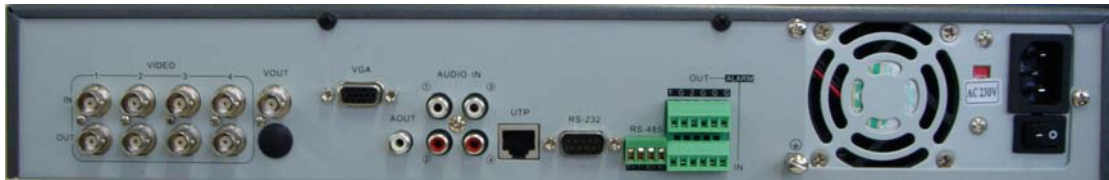
Rear Panel of 4 Channel Unit